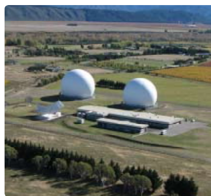
Figure 2: GCSB Waihopai

During the year, the GCSB significantly enhanced its capability by adopting more innovative and cost-effective solutions to address intelligence collection issues. Significant investment occurred in particular at the Bureau's satellite facility at Waihopai.