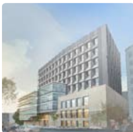
Figure 3: New GCSB Head Office

During the year the Bureau experienced a staff turnover of 8.9%. At the end of this reporting period the Bureau had 314 full time equivalent staff.